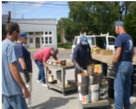
Volunteers at work

A representative from the Eastern Shore Food Bank was on site and accepted over 150 lbs. of usable paint. Paint is the most common source of household hazardous waste.