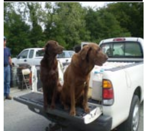
Canine supervisors keeping watch

The event was sponsored by Accomack and Northampton Counties, the Eastern Shore of Virginia Ground Water Committee, the VA Coastal Zone Management Program, and the Accomack-Northampton Planning District Commission.