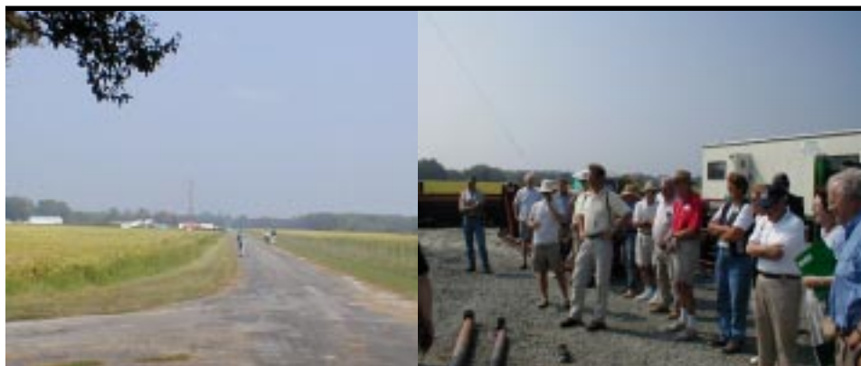
The drilling site (left) and observers (right)

The drilling rig used was built in the 1960s to core minerals in mining exploration. The rig had come from Arizona and will be returning there once it has done its work here on the Eastern Shore. The drilling is planned to wrap up in December.