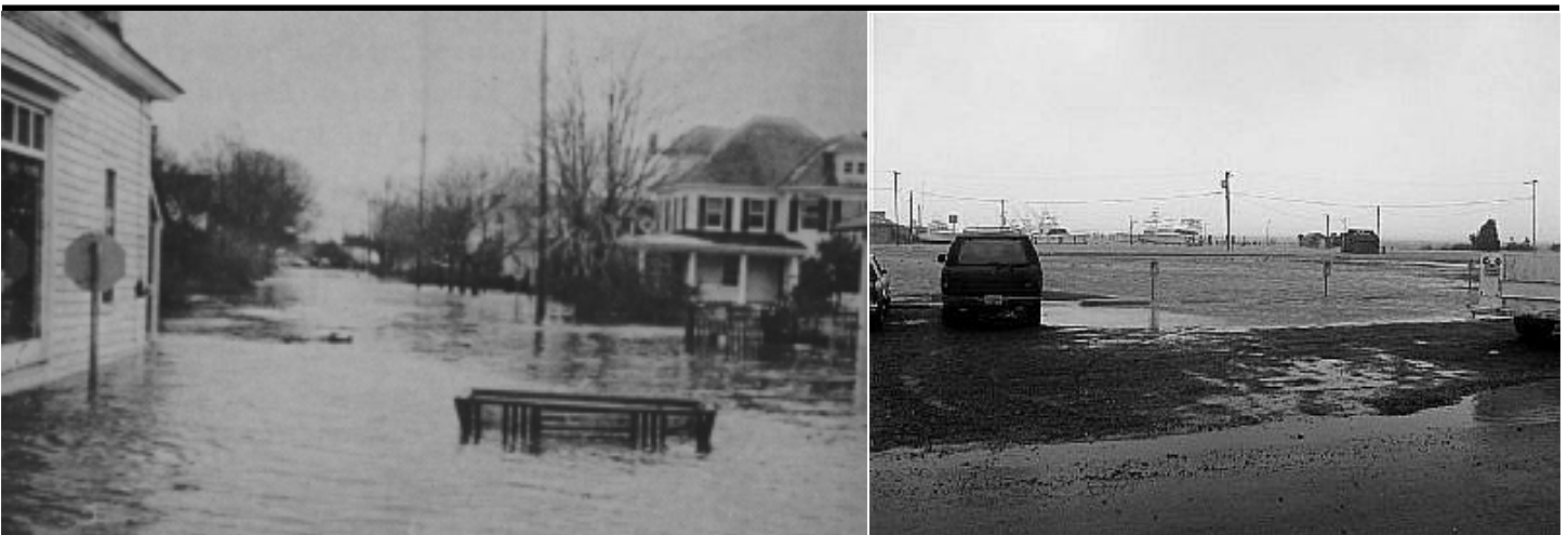
Views of Flooding in the Vicinity of the Wachapreague Fire House. (Left) Brooklyn Avenue and Main Street during the Ash Wednesday Storm of 1962 (Right) View of Hurricane Isabel Flooding from the Wachapreague Fire House

The A-NPDC staff will be sending out letters to project participants announcing upcoming information meetings. A Request for Proposal has already been advertised for an engineer and surveyor.