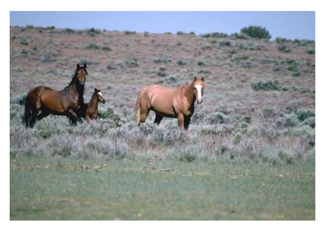
Bay (left) and Chestnut (right)

Bay (left above) : Body color ranges from a light reddish-brown to very dark brown with "black points." (Points refer to the mane, tail, and lower legs).